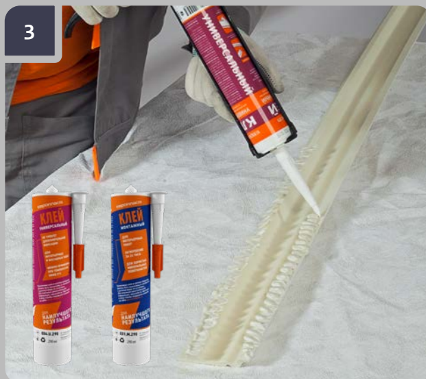
3 Apply «Evroplast Mounting» adhesive on the mounting surface (only in the area of junction to the wall) or «Evroplast Multipurpose» adhesive along the length of the product. The thickness of the applied layer of adhesive shall be 3-5 mm.