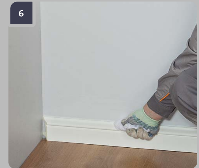
6 If necessary wipe the area of junction between the product and the wall with a cloth wetted with water if using «Evroplast Mounting» adhesive; with acetone if using «Evroplast Multipurpose» adhesive.