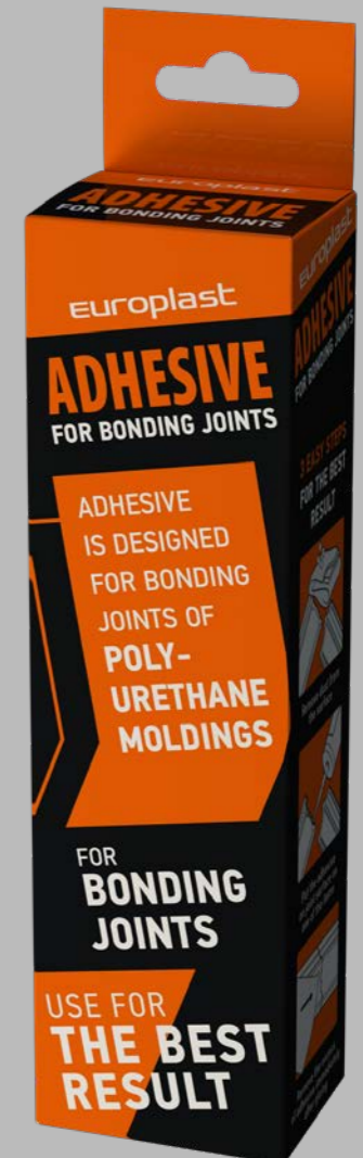
MULTIPURPOSE ADHESIVE 290 ml