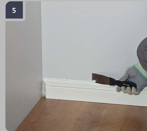
5 Immediately after attaching remove excess adhesive using putty knife.