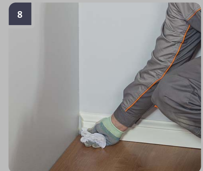
8 Wipe the end surfaces of abutting products with wet cloth to remove dust and other contaminants.