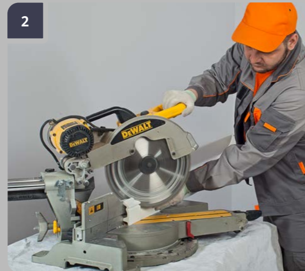
2 Set the angle on the trimming saw, make a cut on the product. In rooms with 90° corners it is possible to use a mitre box and a hand saw.