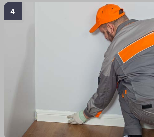
4 Affix the product to the place of installation according to the marking on the wall. Press the product along the whole length so that adhesive exudes from under the whole junction surface.