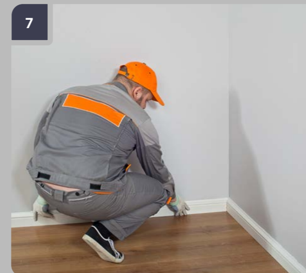
7 Cut the next product. Check the joining of the profile of products, if necessary redo the cut.