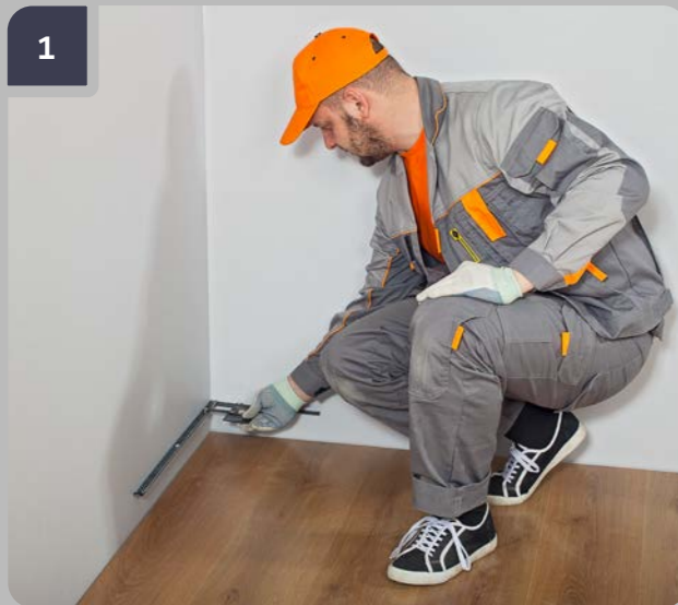
1 Using angle finder measure the angle of the corner of the room.