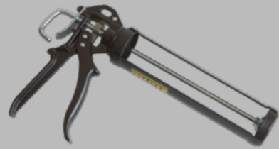
Glue applicator gun