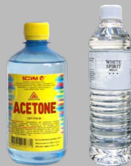
Acetone. White spirit