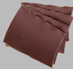
Fine grain abrasive paper