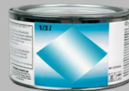
Fine grain water-soluble filler