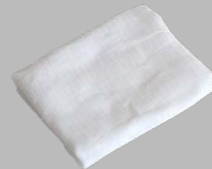
Cotton waste (Cloth)